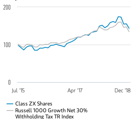
Performance of 100 USD Invested Since Inception (Cash Value)