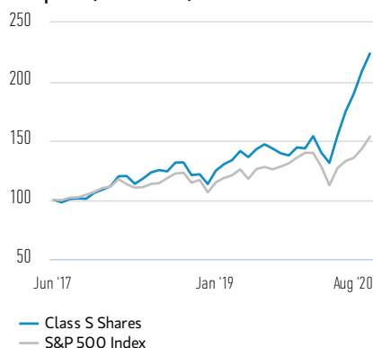
Performance of 100 USD Invested Since Inception (Cash Value)