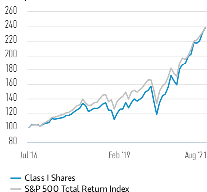
Performance of 100 USD Invested Since Inception (Cash Value)