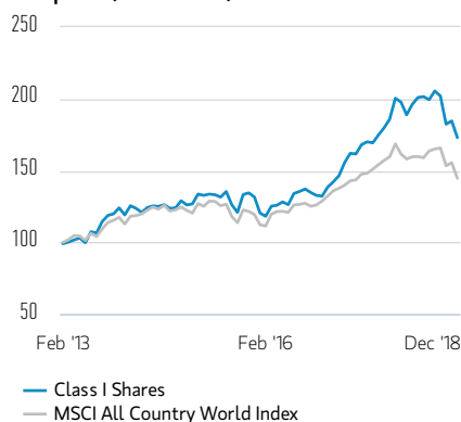
Performance of 100 USD Invested Since Inception (Cash Value)