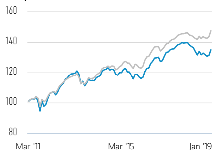
Performance of 100 USD Invested Since Inception (Cash Value)