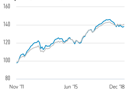
Performance of 100 USD Invested Since Inception (Cash Value)

— Class AX Shares — JPM Corporate Emerging Markets Bond Index-Broad Diversified Index