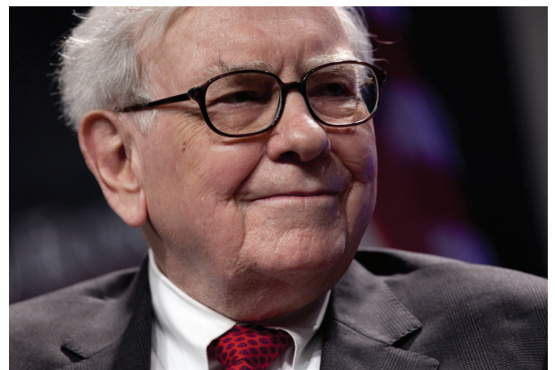
Warren Buffett

▶ NOTE: The Global Opportunity Fund has risen 7.9 percent since Jan. 1 and returned an annualized 23 percent over the past five years, to beat more than 95 percent of peers tracked by Bloomberg.