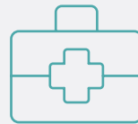
Health and Wellness