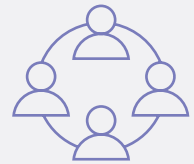
Diversity and Inclusion