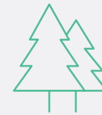
Conservation and Biodiversity